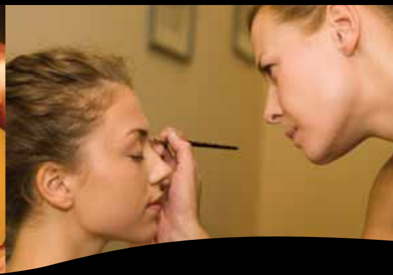
Professional make-up artist